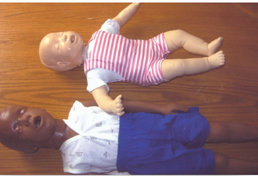
We have a pediatric specific curriculum.. great for daycare providers or parents!

CPR Professionals 763-951-2443 www.cprprofessionals.net