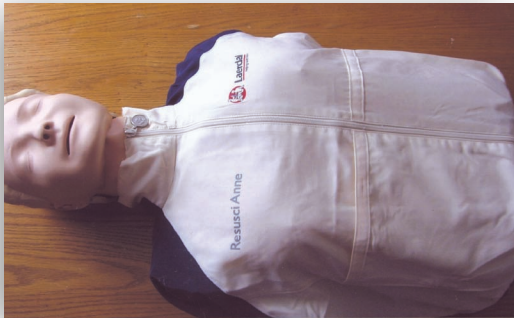
Enjoy our customized training specific to your workplace.